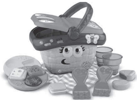
Shapes & Sharing Picnic Basket* 6-36 months

Fun next steps on your child's path to learning!