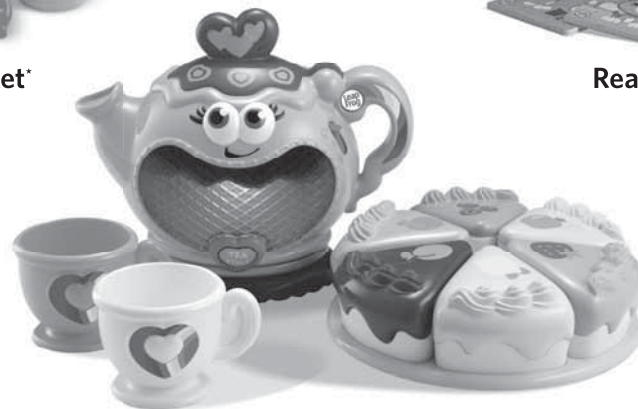
Musical Rainbow Tea Party* 12-36 months

Get more ideas to support your child's learning at: leapfrog.com