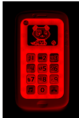
Chat & Count