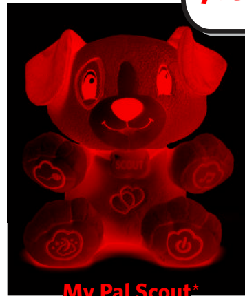
My Pal Scout*