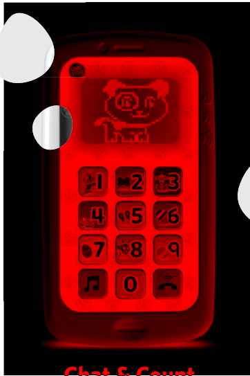
Chat & Count Smart Phone*