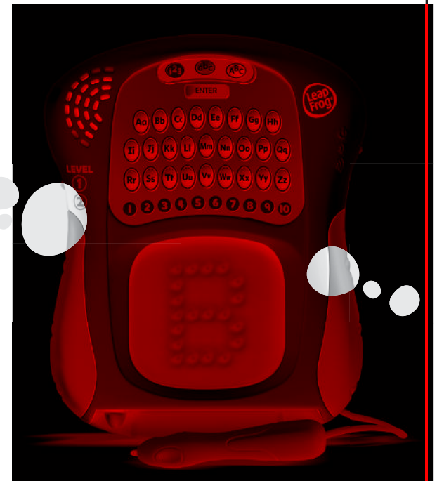
Scribble & Write*