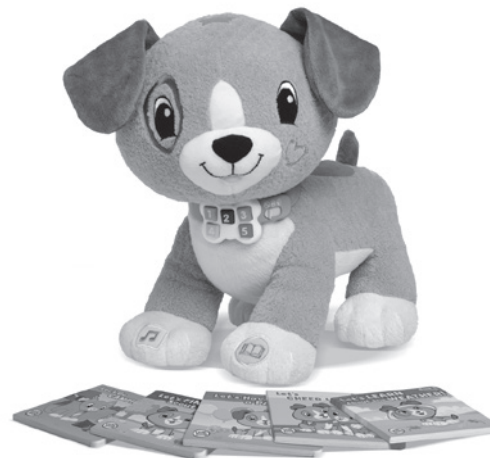
Read With Me Scout 2-5 years

Get more ideas to support your child's learning at: leapfrog.com/learningpath