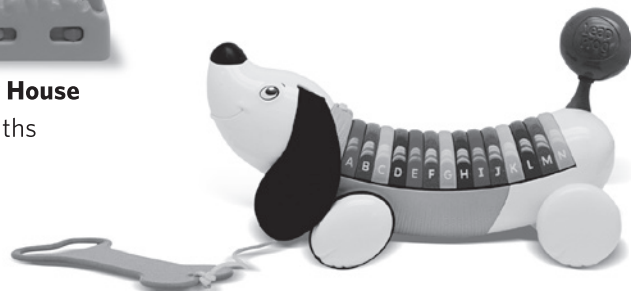
AlphaPup™ 12+ months