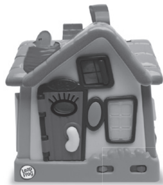
My Discovery House 6-36 months

Fun next steps on your child's path to learning!